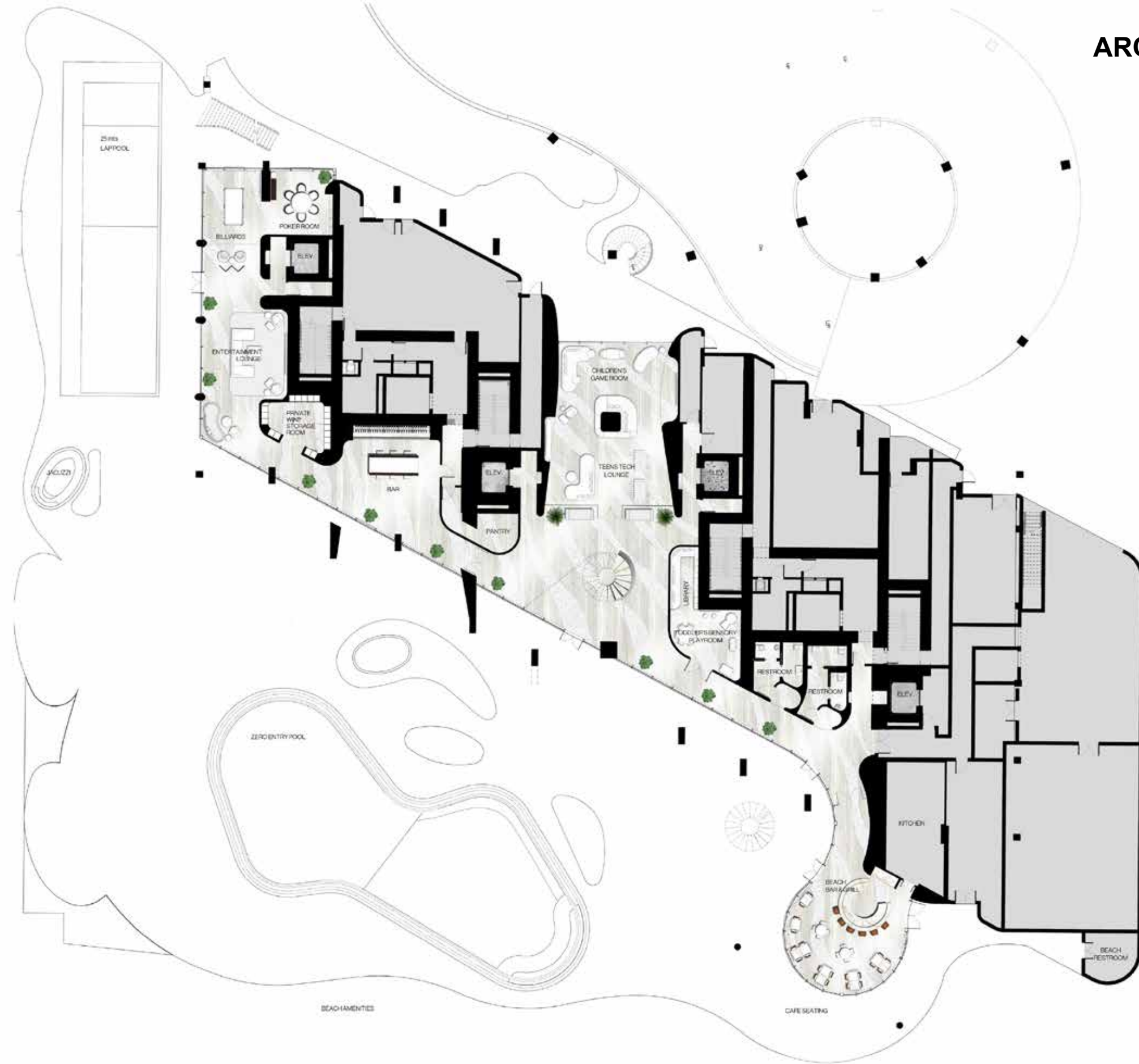
GROUND AMENITY LEVEL