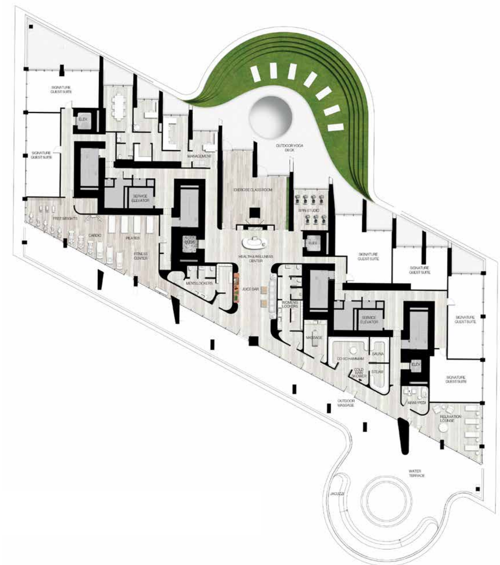
FITNESS & SPA AMENITY LEVEL